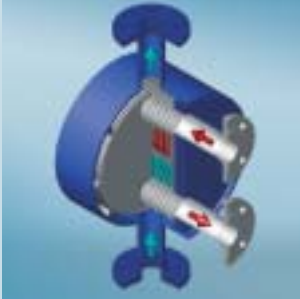
Plate & Shell®, Fully Welded