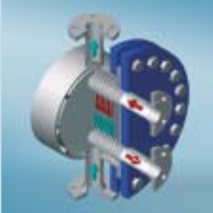
Plate & Shell®, Compact